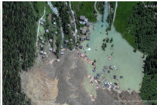
Blatten in May 2025