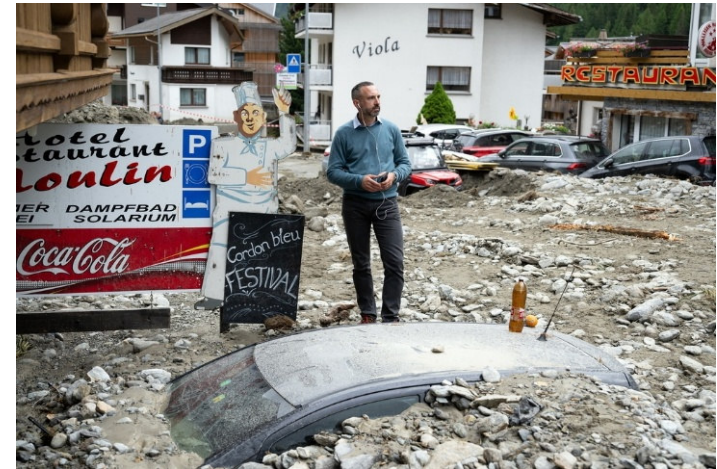
Government Councillor in Saas Grund