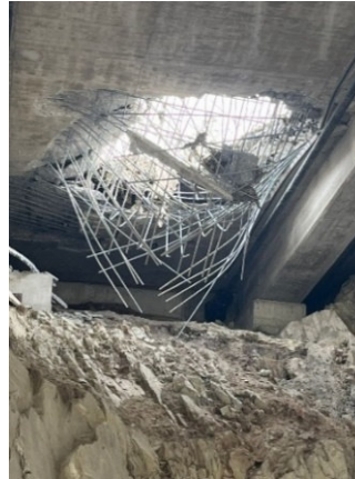
Landslide in Anniviers (03.2024)