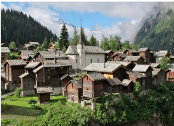
Blatten before May 2025