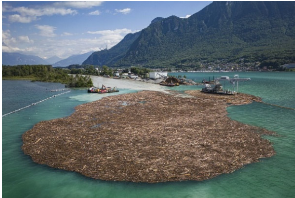
Rhône estuary in Le Bouveret