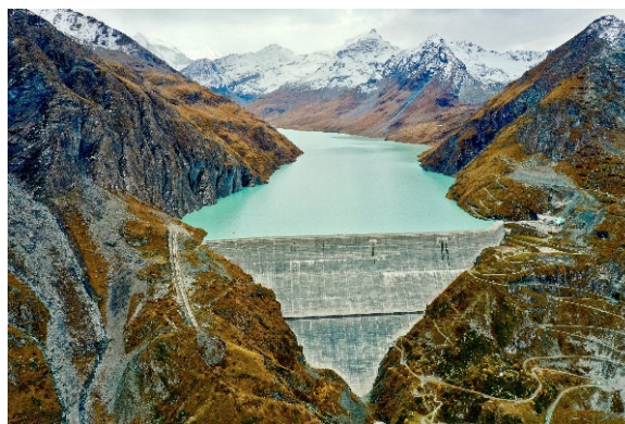
Grande Dixence dam