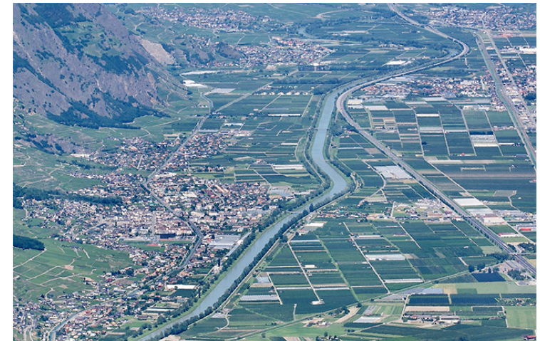
Rhoneebene zwischen Fully und Riddes