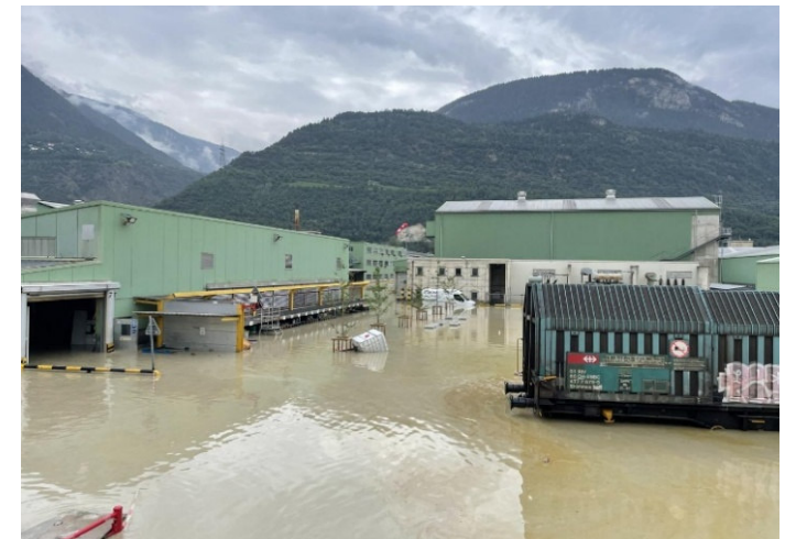
Industry (Novelis) in Sierre