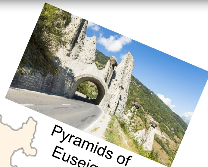
Pyramids of Euseigne