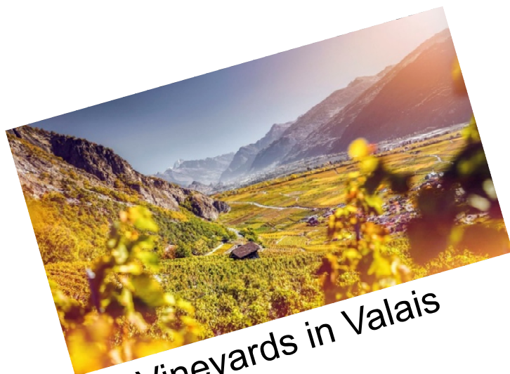
Vineyards in Valais