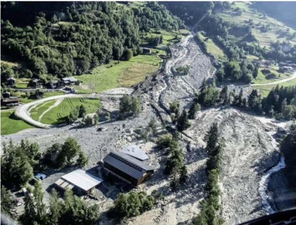
Mudslide in Lourtier (07.2024)