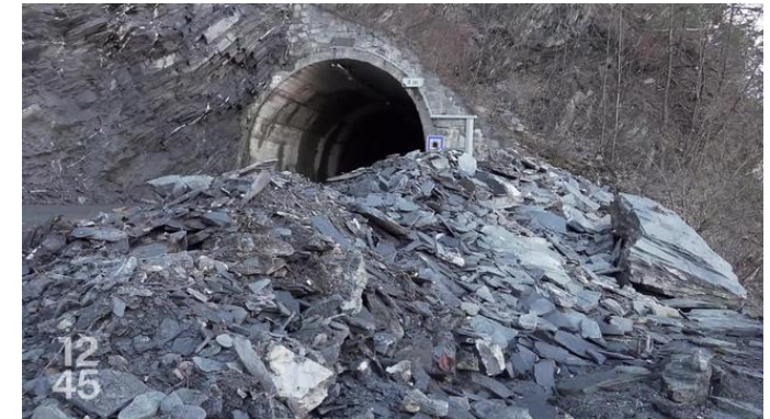
Collapse of a tunnel in Riddes (02.2024)